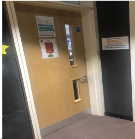
This is the internal door to your classroom