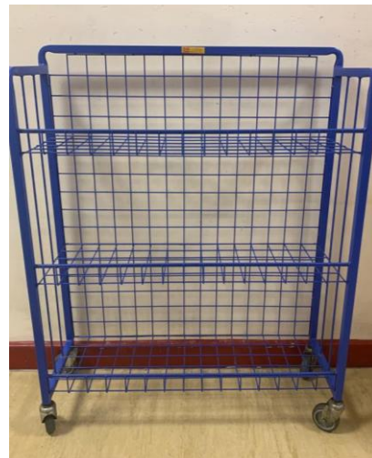
This is where you will put your water bottle and lunch bag (if you have one)