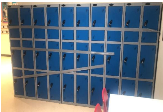
These are the lockers for Your bags and coats