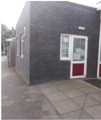
This is the outside door to your Classroom