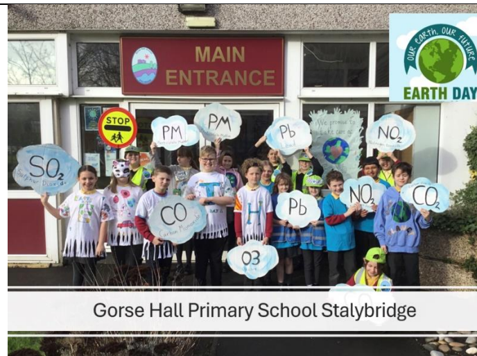
Gorse Hall Primary School Stalybridge