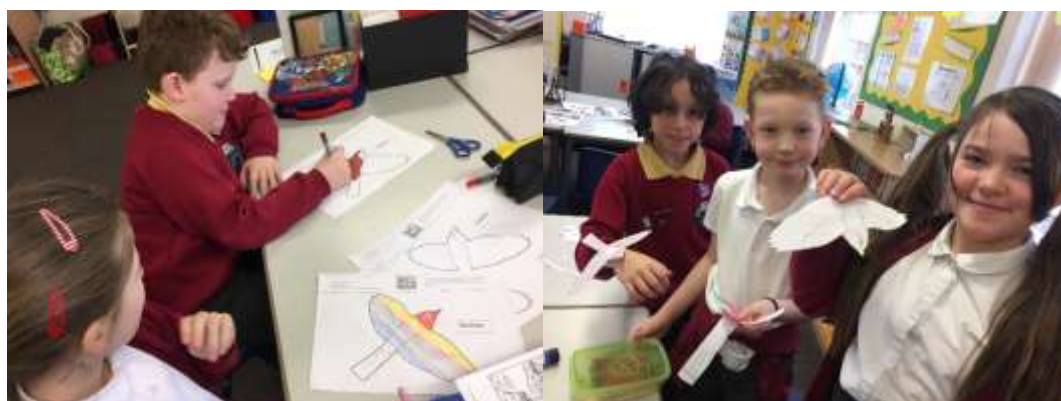
Making and decorating our feathered friends.

Our data showed an increase in small birds such as Blue tits, chaffinches and even a long tailed tit. We always welcome back the blackbirds but the black headed gulls can sometimes be a nuisance at break/lunchtimes.